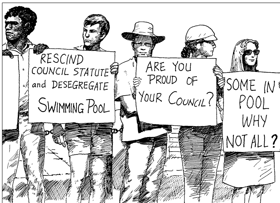
Students protesting at the Moree Pool.